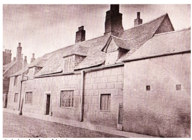
Original school in Cowgate

The school opened in 1722 and remained on site for 161 years until 1883 when it moved to Crown Lane. The site was sold by auction for £3,150.