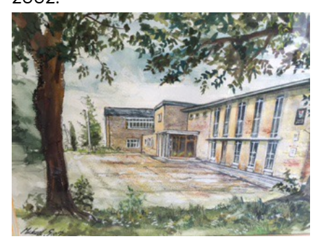
Drawing of Deacon's School in Queen's Gardens.

Deacon's achieved many accolades, including becoming a Specialist Technology College in 1994, Beacon School in 1999 and Leading Edge School in 2002.